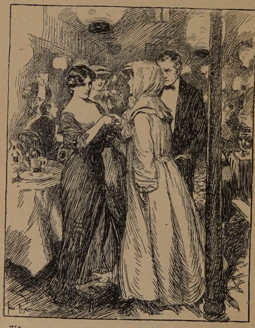
"I AM VERY GLAD TO KNOW YOU, MRS. MANNERING'" Frontispiece [See Page 198